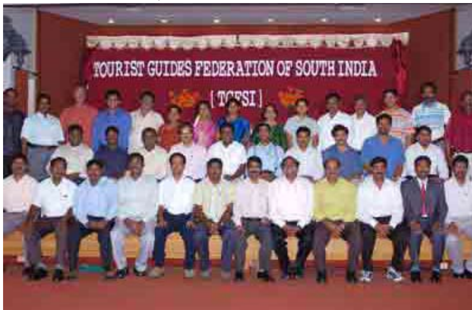
Members at the annual conference at TGFSI at Chennai

happy to have this special day dedicated exclusively to them – more so as it was celebrated simultaneously by all the WFTGA members all over the world. As a part of the celebration a special dinner was hosted by TOGA. The poster by WFTGA – ‘Is Your Tourist Guide Qualified?’ – was also launched. A quiz was also created on the monuments of the world displayed on the poster. This effort by the WFTGA to curb the menace of touts and unlicensed guides has been greatly appreciated by the travel trade.