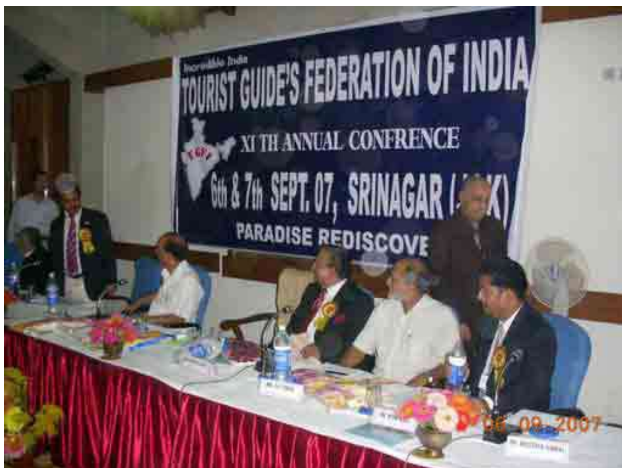
TGFI 11th Annual Conference at Srinagar

TOGA has approximately 130 members who are all licensed tourist guides. It was established about four decades ago. Tour assignments are issued by the Government of India Tourist office on the basis of a roster system, to ensure equitable distribution of work and fair play. This association celebrated International Tourist Guides' Day in February this year for the very first time. The tourist guides of Mumbai were extremely