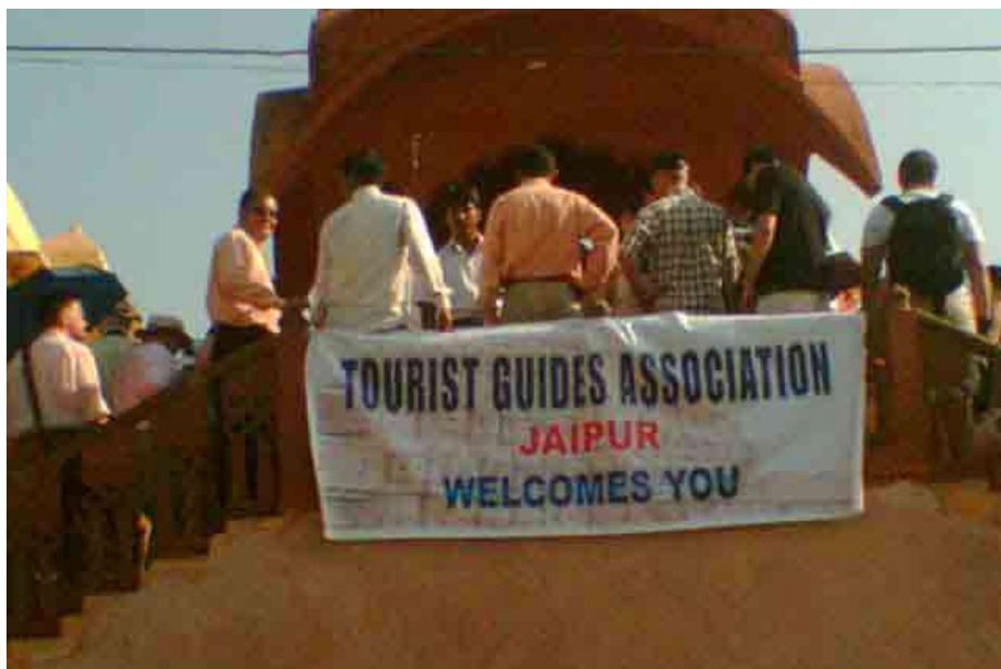
Tourist Guides Association Jaipur became a member of WFTGA in 2005